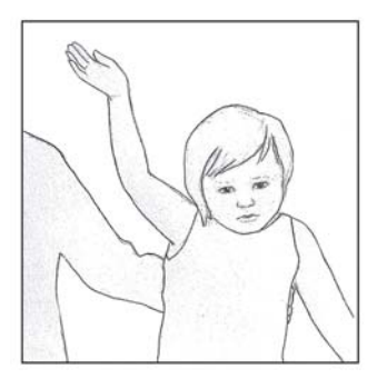
using the trunk to lift the arm