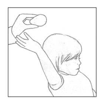
body bent backwards