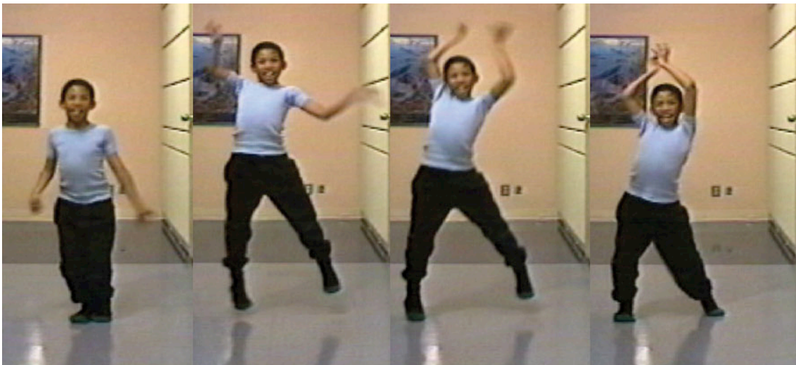
Figure 2b (below) (Caption) Note range of right arm movement during "jumping jacks", a non-habitual movement pattern. (end Caption)